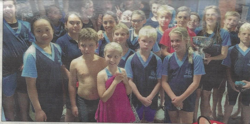
TROPHY WINNERS: Southampton Dolphins SC.